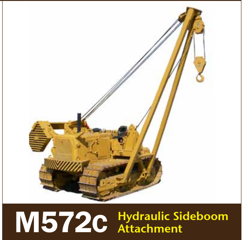
M572c Hydraulic Sideboom Attachment